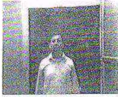
IInd Party न्यासी