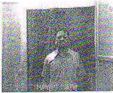
Ist Party न्यासकर्ता

Reg. No. 7116 Reg. Year 2011-2012 Book No. 4